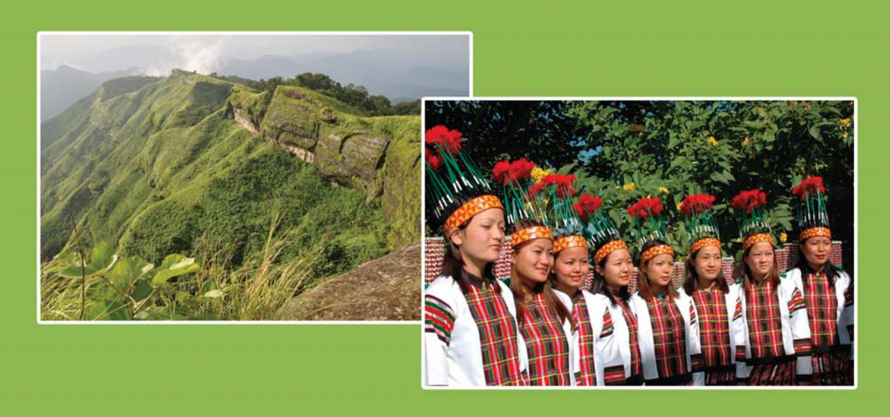
carrying forward the unique cultural heritage