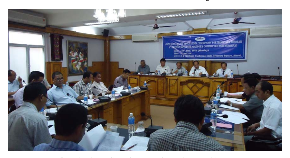
State Advisory Committee Meeting, Mizoram, Aizawl

After extensive deliberations on the impact of power purchase cost, employee cost, R&M cost, interest and finance charges and cost of supply on tariff fixation, the Committee decided to make the following recommendations.