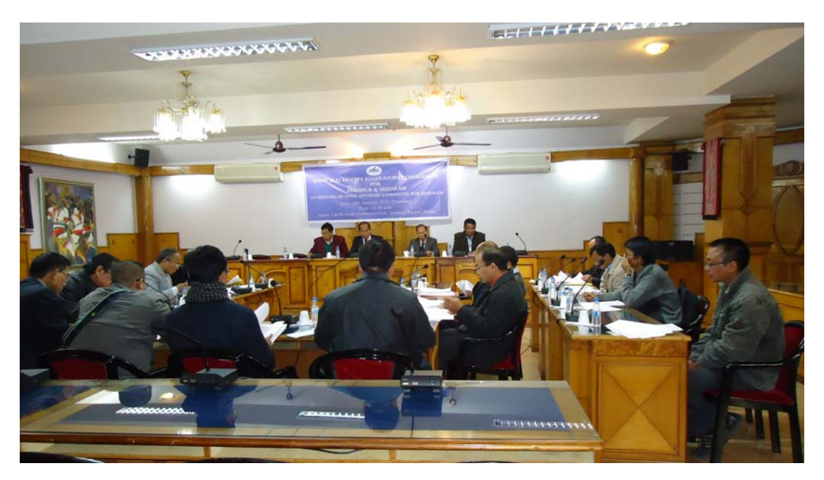
State Advisory Committee Meeting, Mizoram, Aizawl