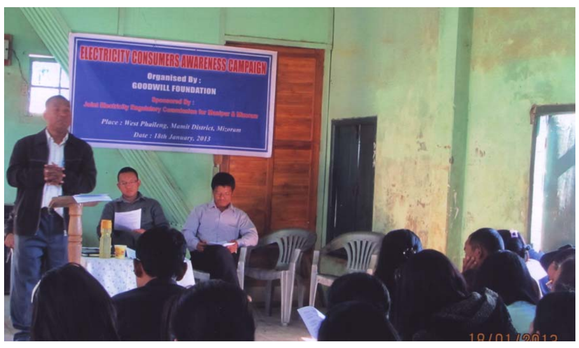
Electricity Consumers Awareness Campaign organised by Goodwill Foundation, West Phaileng, Mamit District, Mizoram on 18th January, 2013