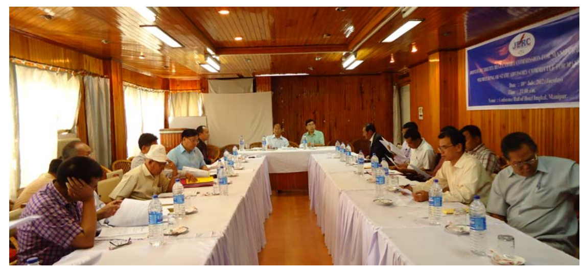
State Advisory Committee Meeting, Manipur, Imphal

(i) The 9<sup>th</sup> meeting of the State Advisory Committee, Manipur discussed extensively the needs to be perceived for determination of Retail Electricity Tariff for the year FY 2012-2013 in respect of the Electricity Department,