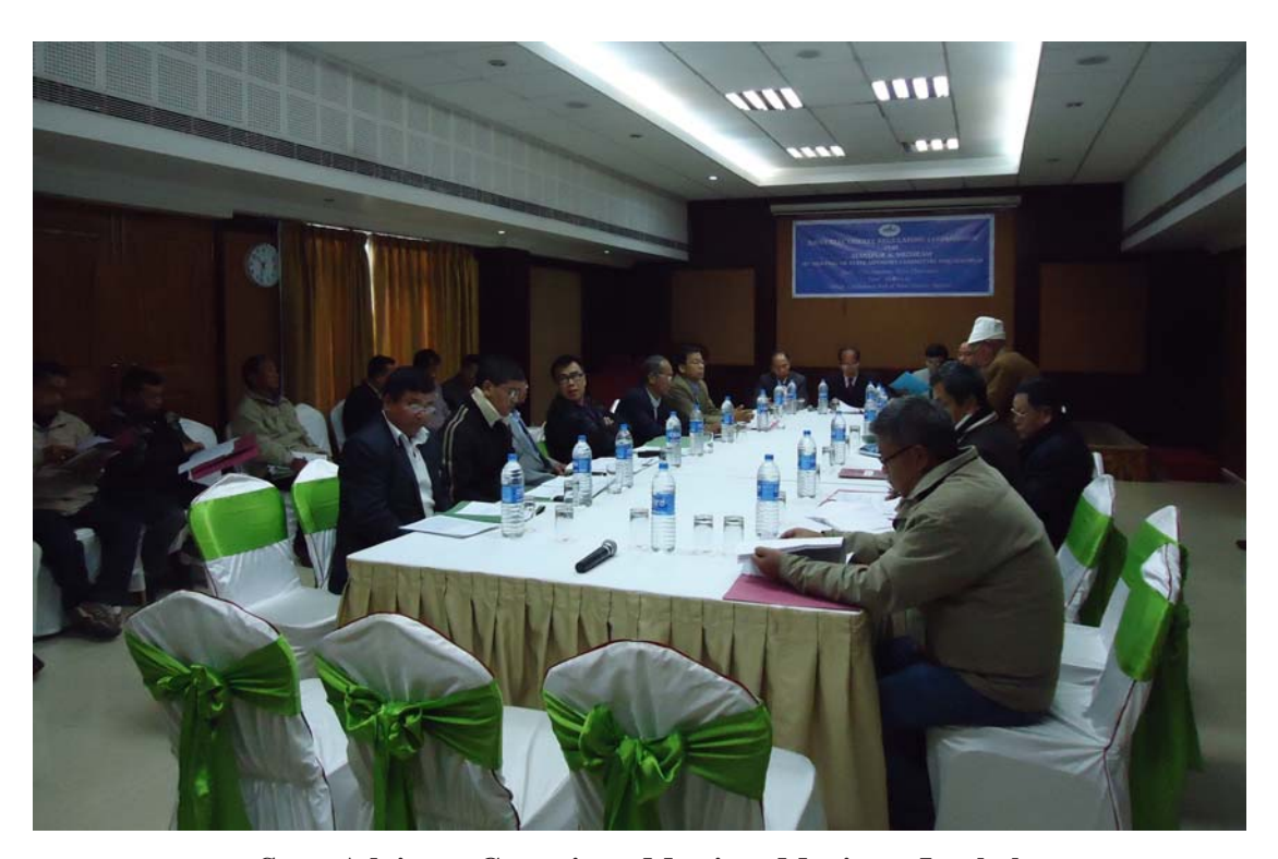
State Advisory Committee Meeting, Manipur, Imphal