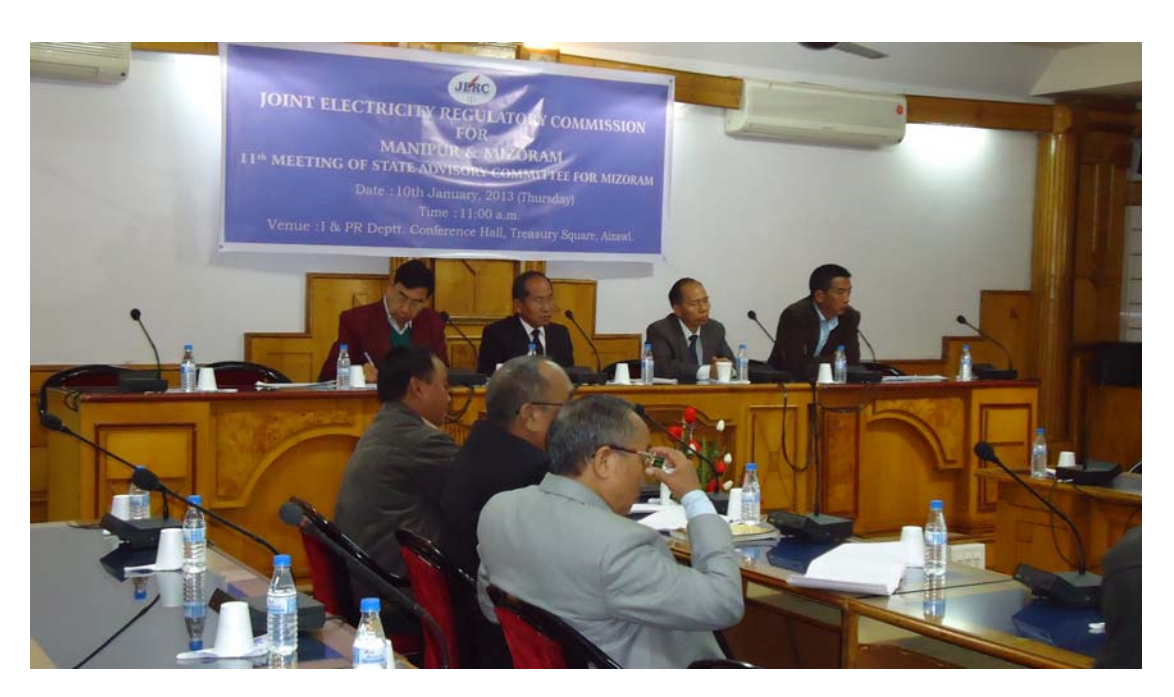
State Advisory Committee Meeting, Mizoram, Aizawl

In regard to power supply scenario & consumers' satisfaction, the Committee considered the present power supply as good. However, it felt that the districts which are located far from the main sub-stations have been suffering because of unavoidable technical reasons and therefore, urged the Department to make all out efforts to tide over the situation as early as possible.