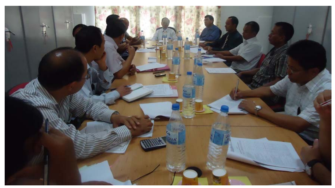
State Co-Ordination Meeting, Mizoram, Aizawl

(i) The 5<sup>th</sup> Meeting of the State Co-ordination Forum, Mizoram was held on 10<sup>th</sup> September, 2012 at the Conference Hall of the Commission. The Forum discussed how far energy theft control measures have been implemented. It was classified about the role of Inspection Squad run by the Department to mitigate the losses. The need to evolve the system of reporting and functioning of Inspection Squad and follow - up action taken by the concerned was deliberated. Therefore, it was decided to customise the Squad with the relevant Act and Regulations in force to suit the needs at the field. The Forum also reviewed the implementation of Tariff Order 2012-2013. On the direction for filing petition for determination of SHP, Transmission Charges & Wheeling Charges, it was agreed that necessary steps for the work – wise segregation shall be started and the required petitions are filed as directed. The progress of Department on implementation of Management Information System (MIS) was also discussed.