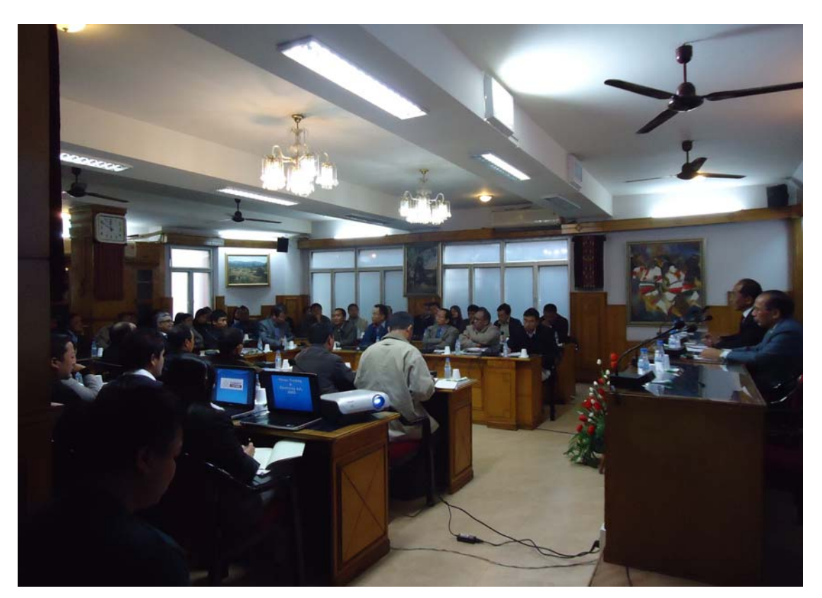
Public Hearing on Issue of Intra-State Trading Licence to M/S Eternity Partners, Aizawl on 8th January, 2013

Therefore, the Commission while going through the financial statements furnished by these Departments finds many areas where reconciliation and coordination are not practically possible. Insufficient and asymmetric data have caused inconvenience and also delay in streamlining the system.