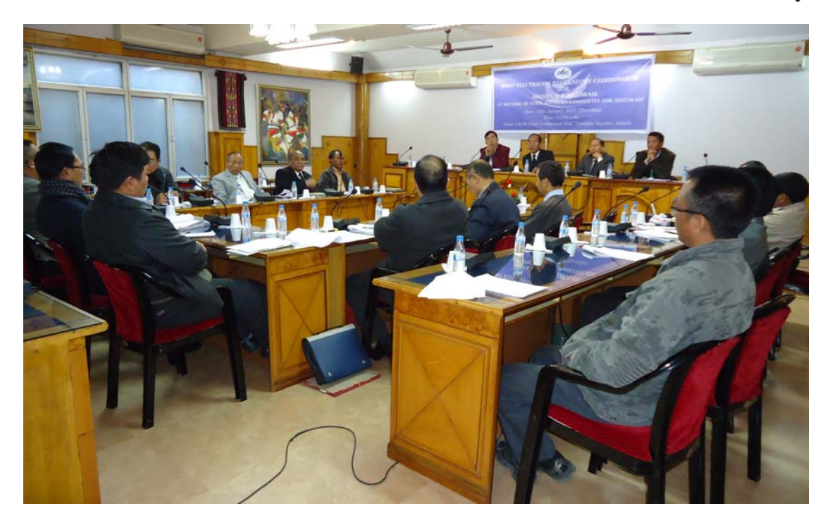
State Advisory Committee Meeting, Mizoram, Aizawl